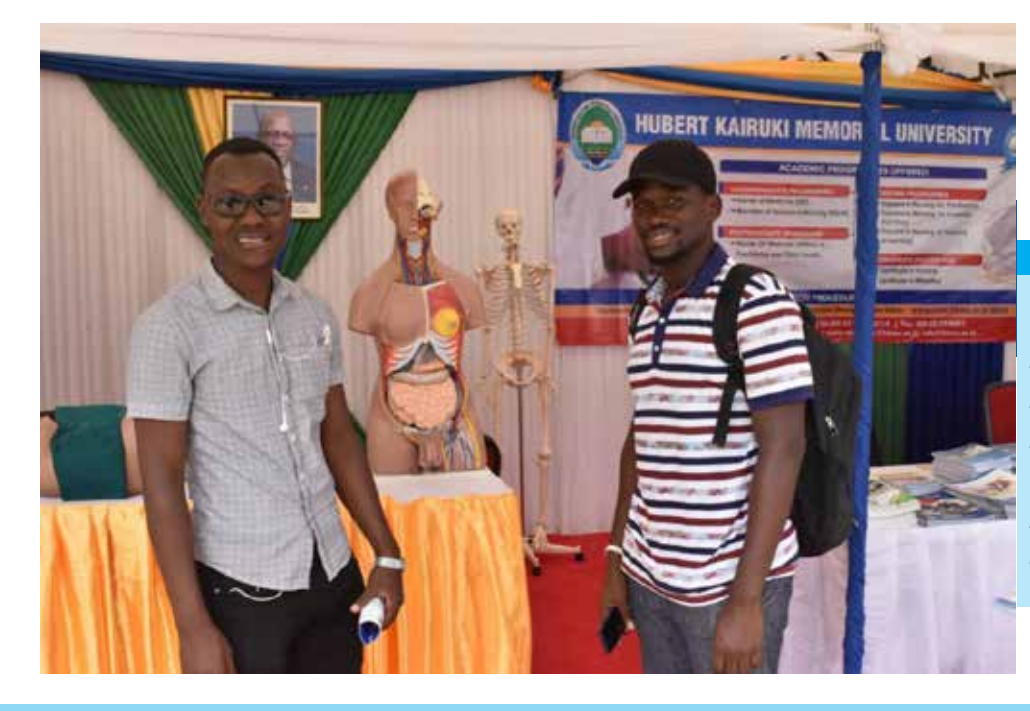
Guests at HKMU Booth during the 14th Exhibitions on Higher Education, Science and Technology at Mnazi Mmoja Grounds, Dar es Salaam, Tanzania.

(MMED), Doctor of Medicine (MD), Bachelor of Science in Nursing (BScN), Diploma and Certificate in Nursing. This information among others was shared to visitors through brochures, fliers, banners and face to face communication. Visitors to the University's booth were also linked to the University's communication platforms such as Website, Facebook, Twitter and YouTube.