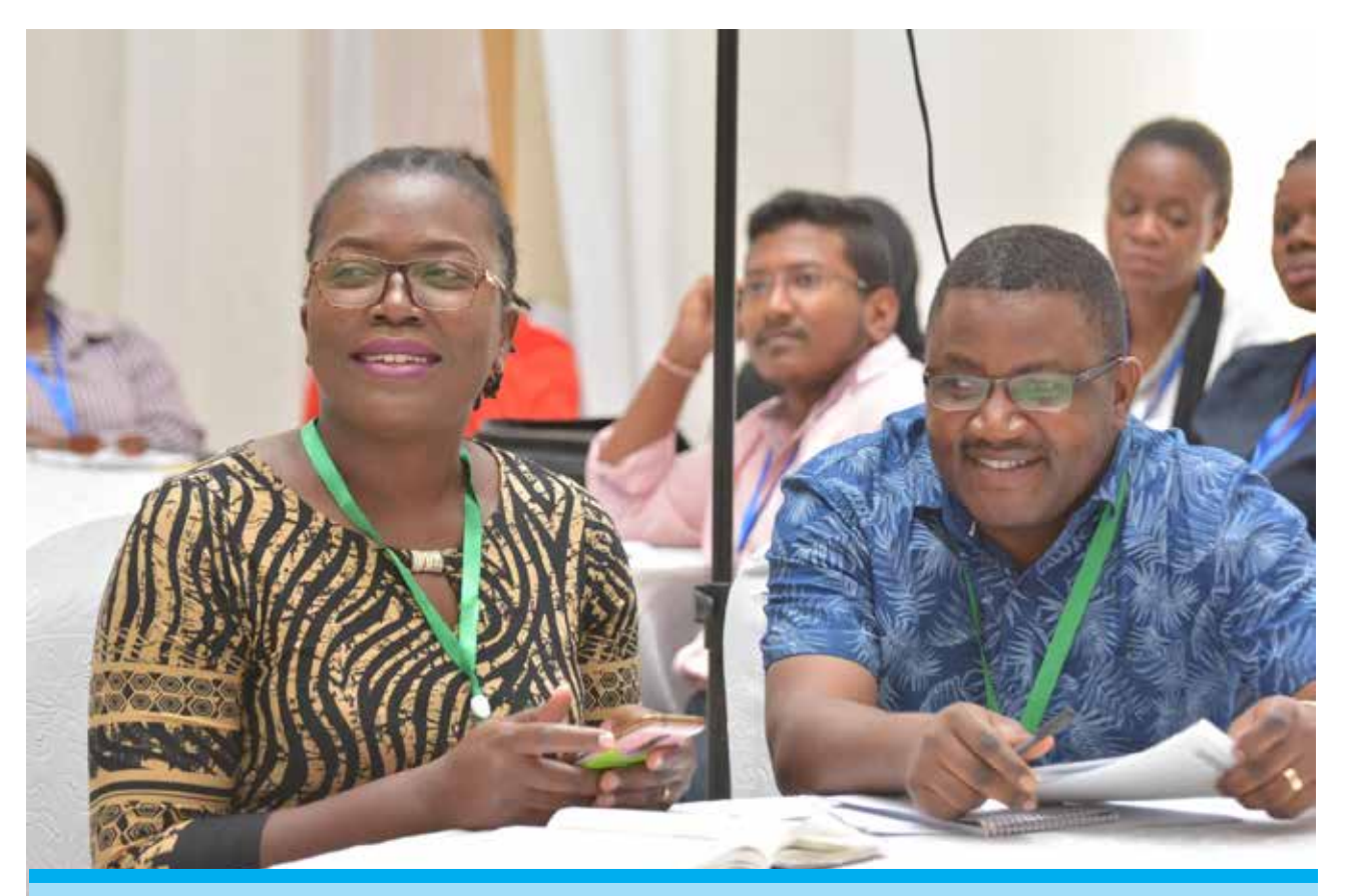
HKMU Academic staff following discussions during the 4th Scientific Conference.