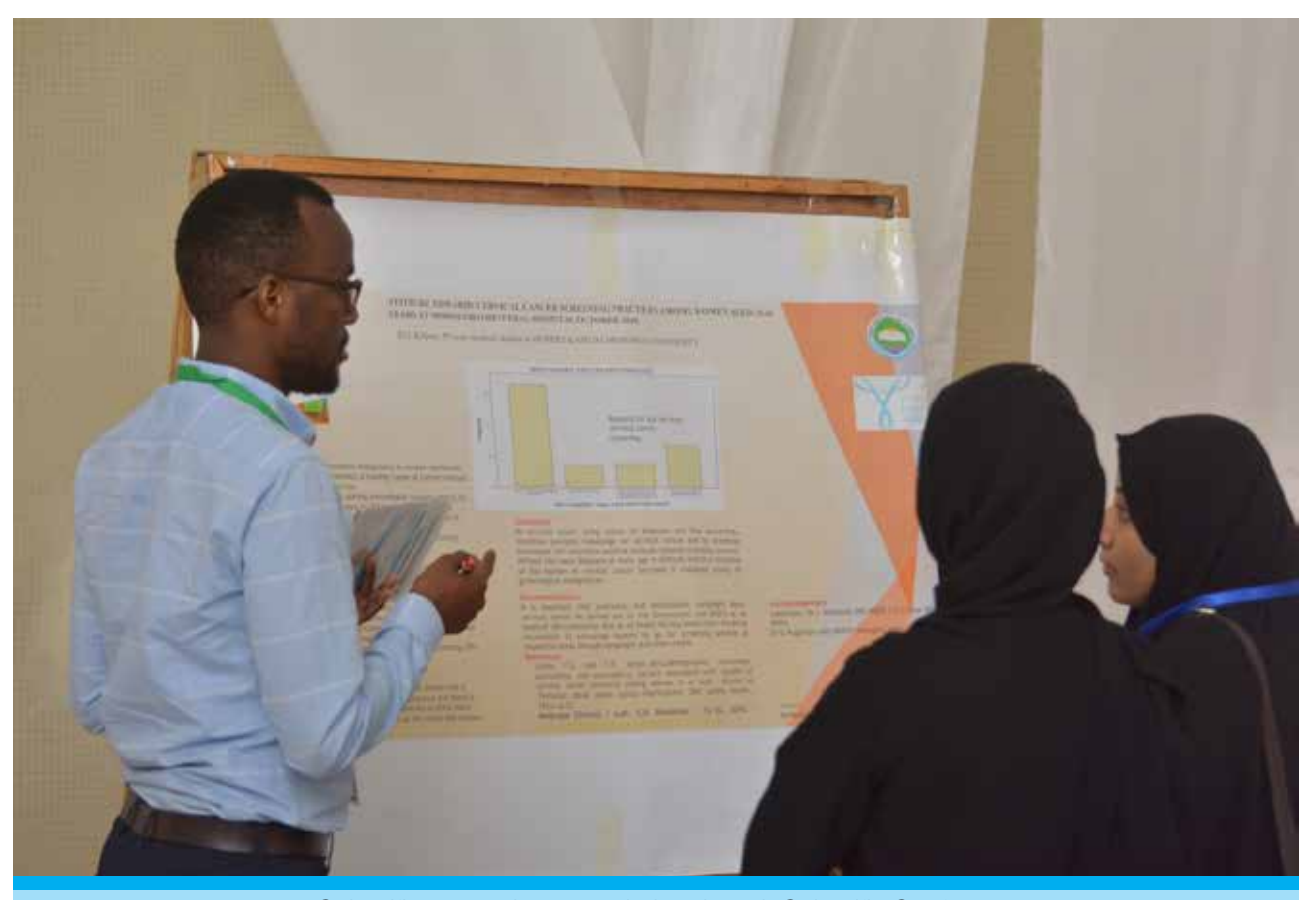
Scientific research poster during the 4th Scientific Conferen