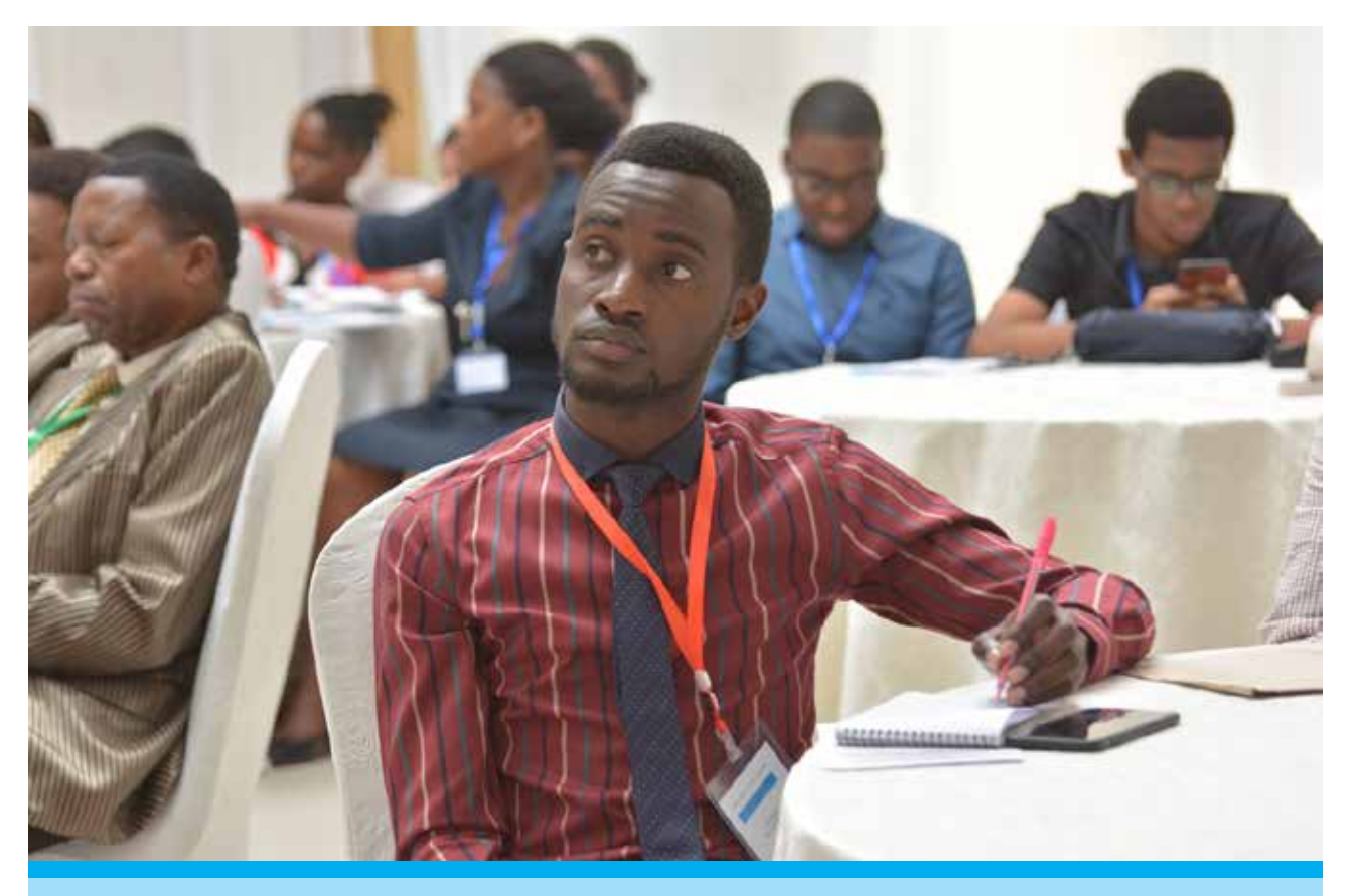
Some attendees of the 4th Scientific Conference.